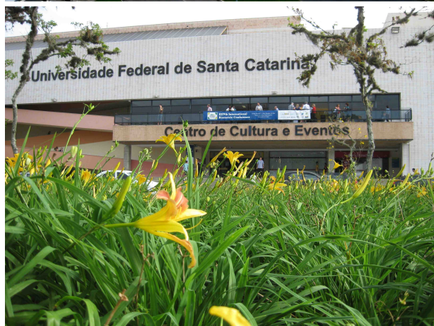
Florianópolis bay and promenade, and conference venue